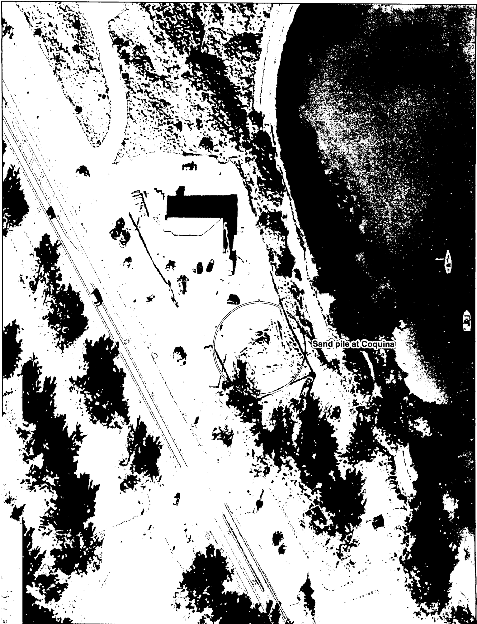
Sand pile at Coquina