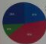
Building Energy Usage