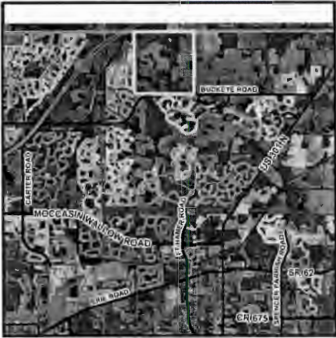
Exhibit B Site Location Map