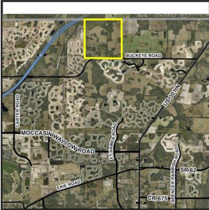
Exhibit B Site Location Map