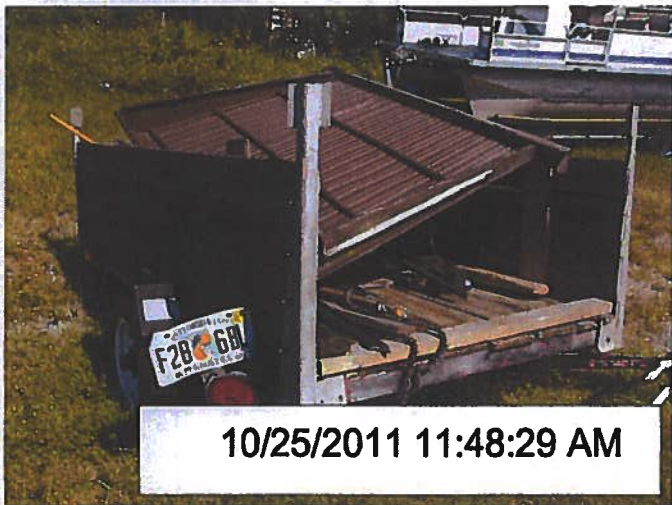
10/25/2011 11:48:29 AM