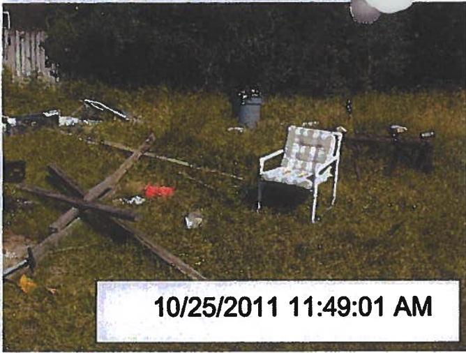
10/25/2011 11:49:01 AM