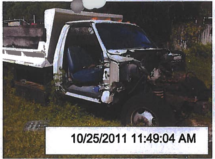
10/25/2011 11:49:04 AM