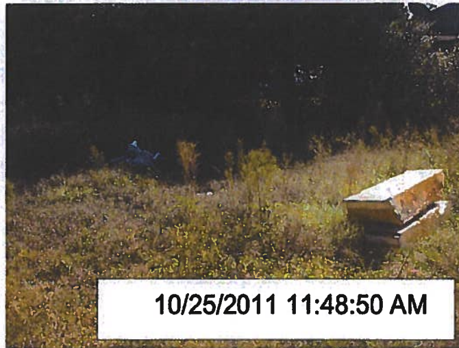
10/25/2011 11:48:50 AM