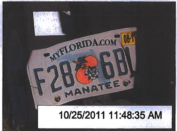
10/25/2011 11:48:35 AM