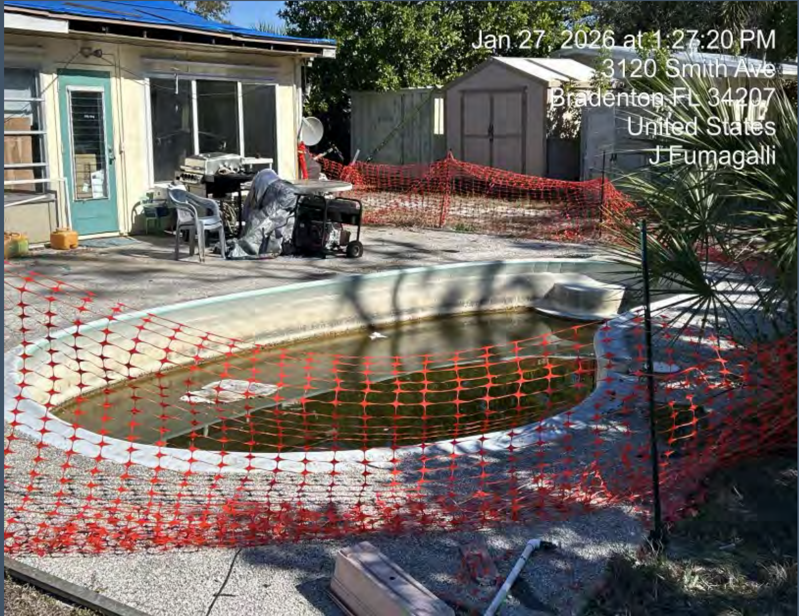
View of the pool water in the backyard.