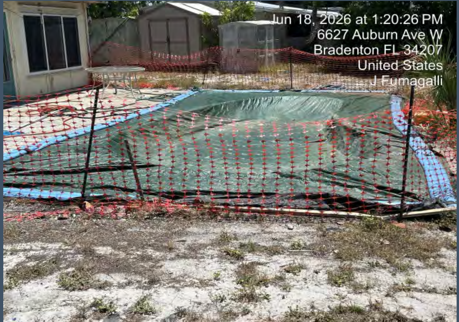
View of the pool covered with a tarp