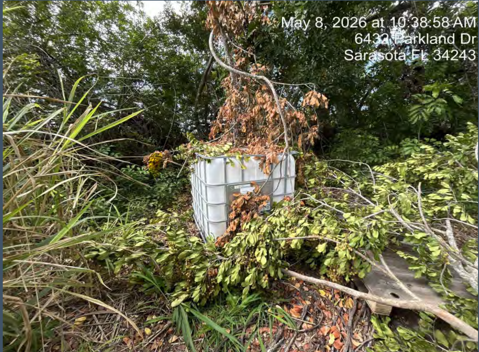
Trash and debris on the property.

Address: 2155 Whitfield Industrial Way, Sarasota