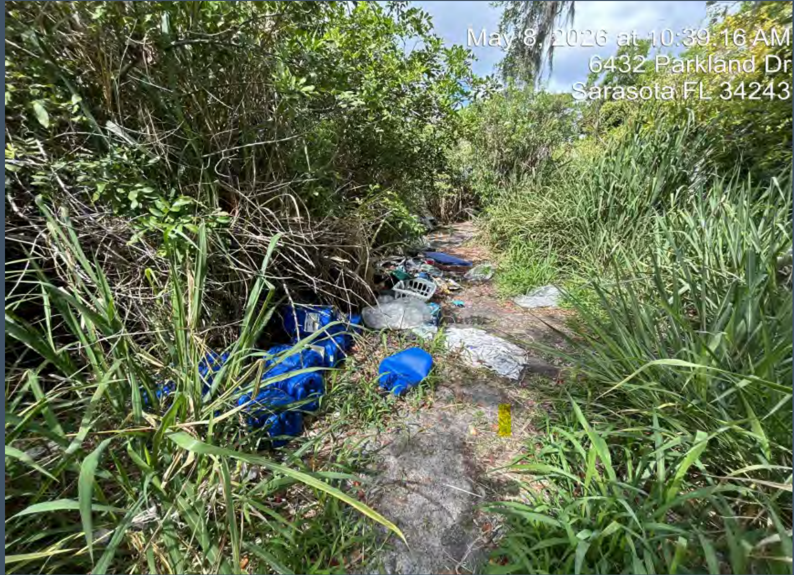
Trash and debris on the property.

Address: 2155 Whitfield Industrial Way, Sarasota