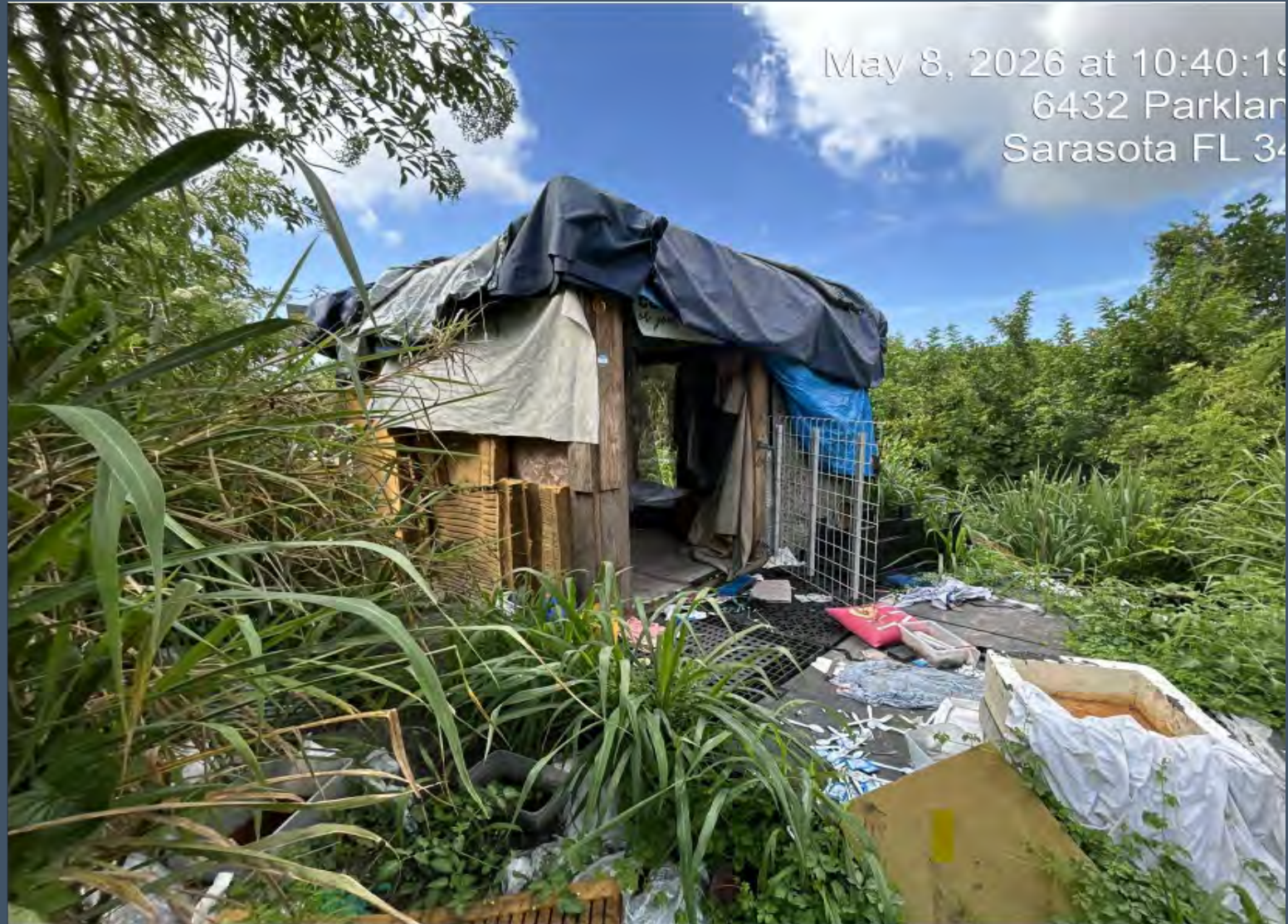
Trash and debris on the property.

Address: 2155 Whitfield Industrial Way, Sarasota