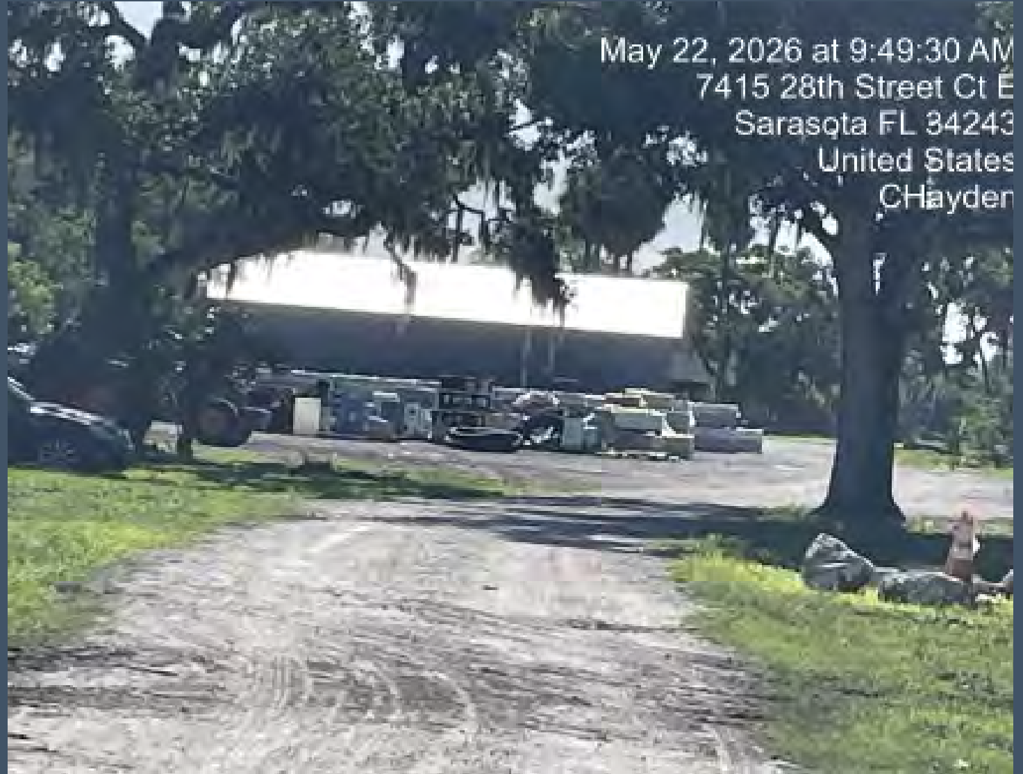
View from the front street

Address: 7419 28 th St. Ct. E., Sarasota