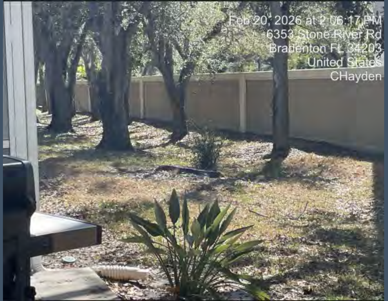
View from the neighboring property