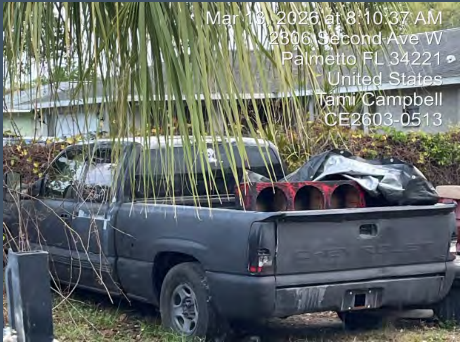
Black pickup with no tag