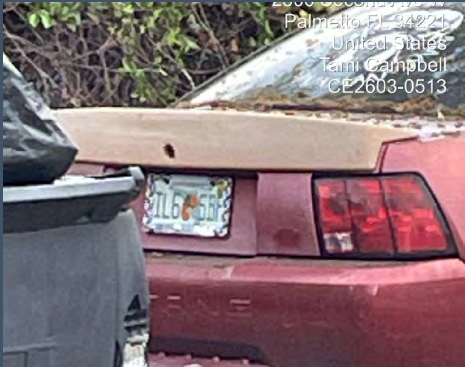
Red Mustang – FL Tag expires 2/24/24