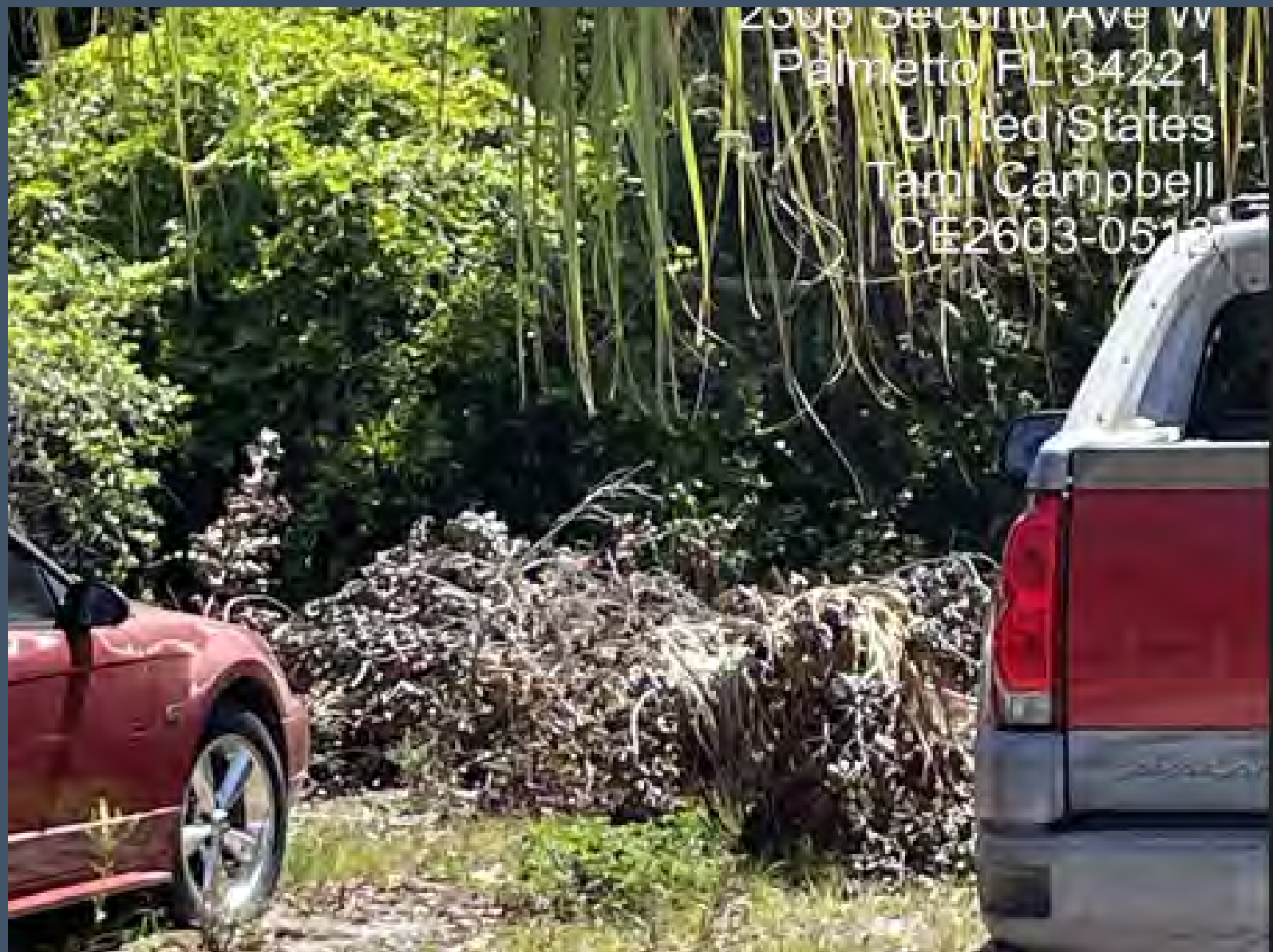
Large pile of tree debris