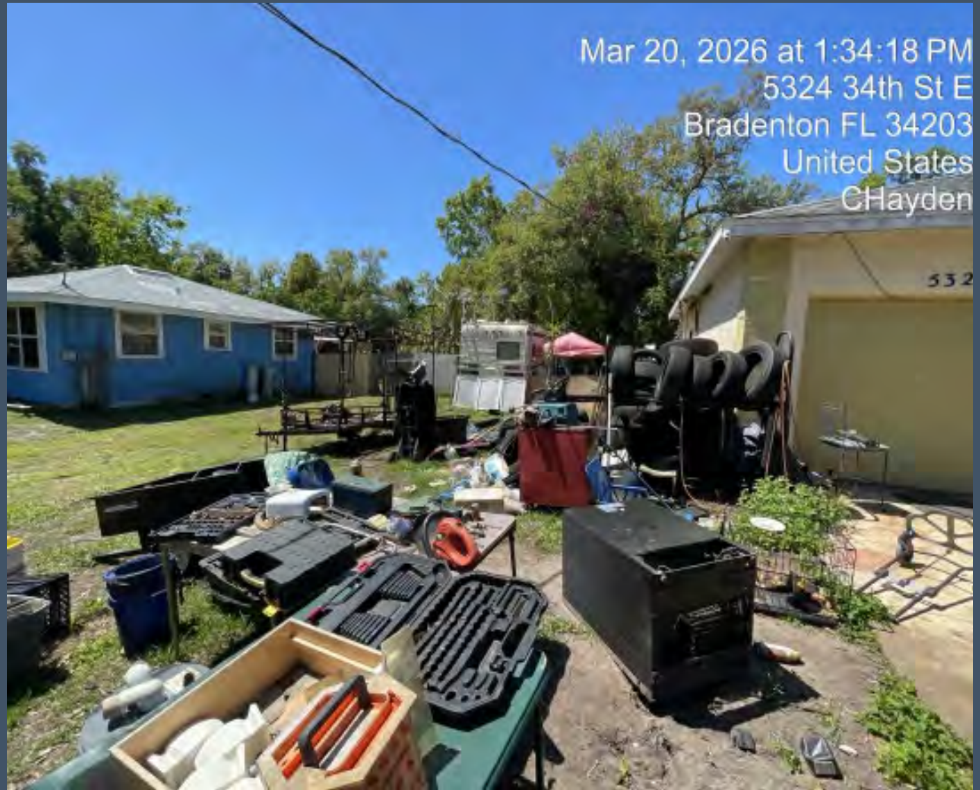
View from the side of the property