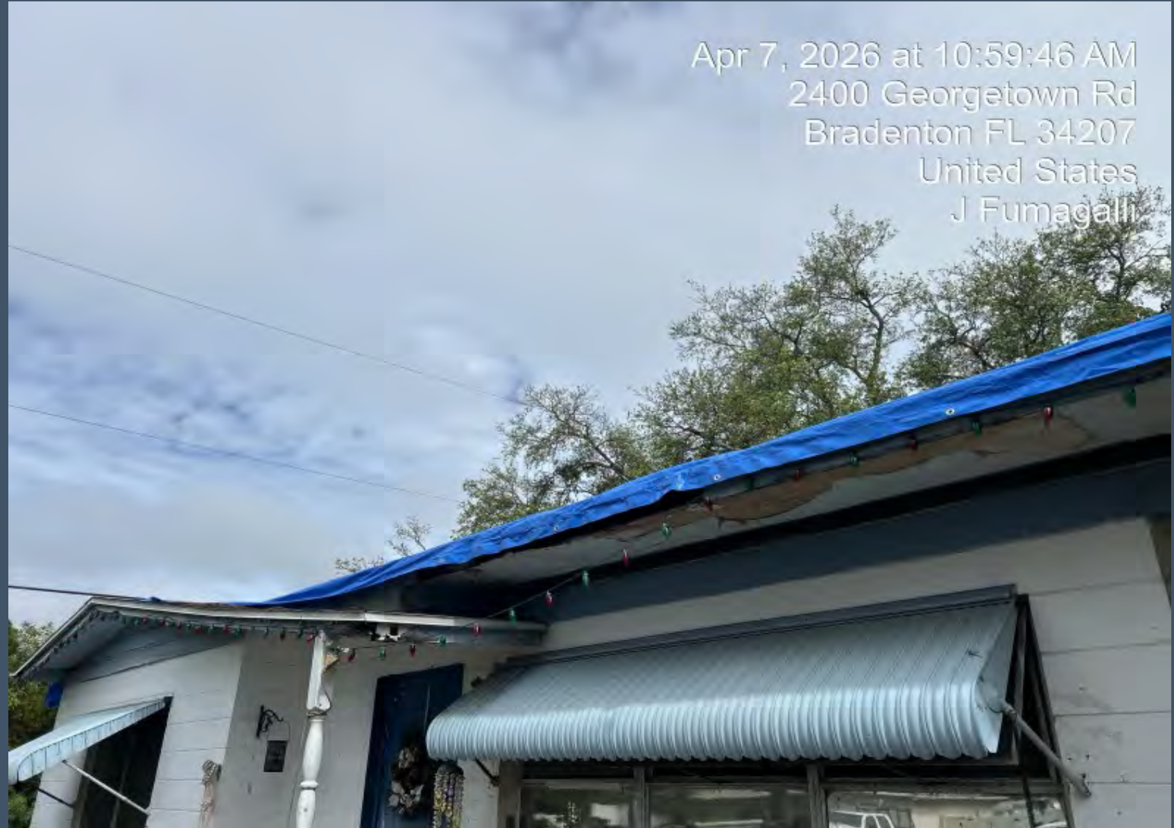
View of the roof from the front of the home.

Apr 7, 2026 at 10:59:46 AM 2400 Georgetown Rd Bradenton FL 34207 United States J Fumagalli