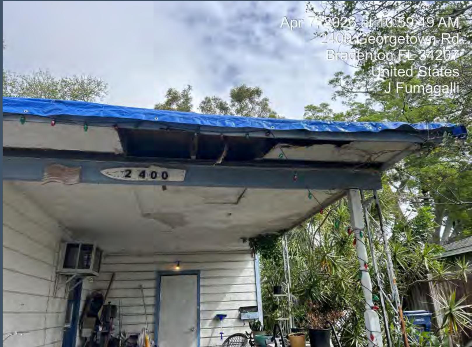
View of the roof from the front of the home.