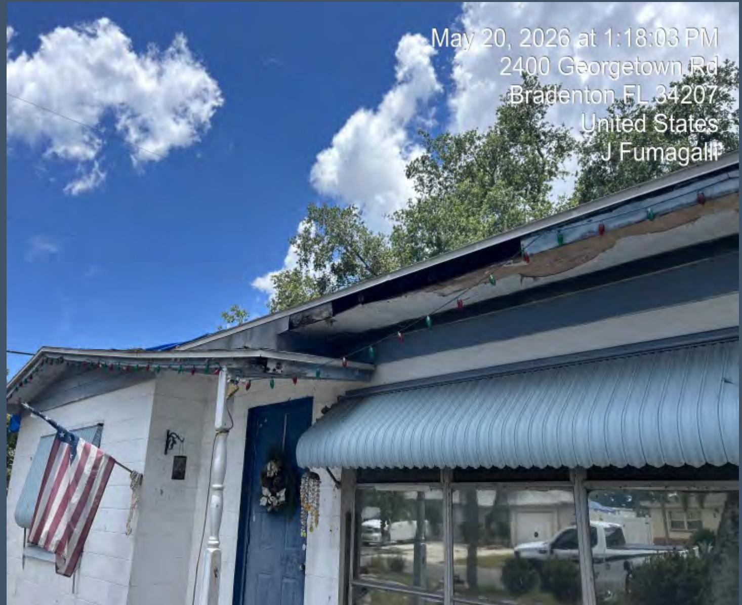
View of the roof from the front of the home.