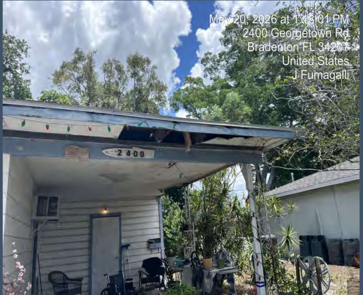
View of the roof from the front of the home.