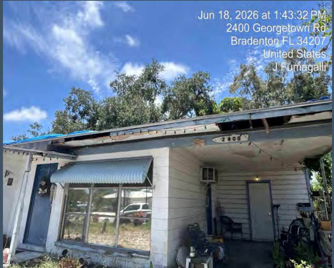
View of the roof from the front of the home.